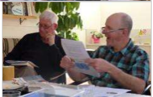
David's Final Preaching Workshop