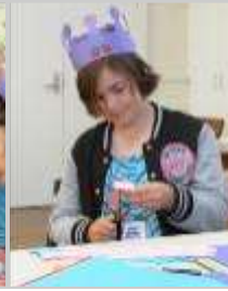
Left & below: The Great Banquet