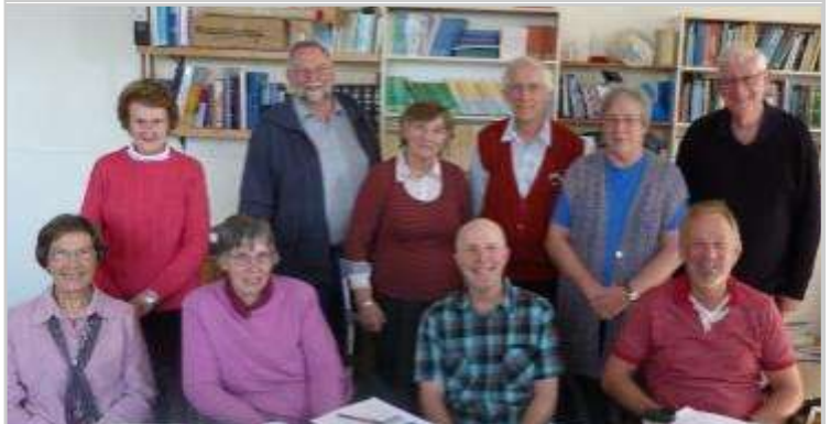
Above & right: